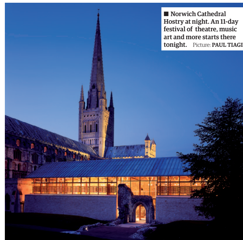
■ Norwich Cathedral Hostry at night. An 11-day festival of theatre, music art and more starts there tonight.

Observations: Around Britain Yesterday and World Yesterday temperatures are quoted at midday local time.